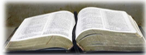
The Holy Bible: The Word of God

The Holy Ghost that is presently moving upon the earth is as real as the sun that you see in the sky. The Holy Ghost is the third person in the Trinity of God; it is the third part of God. Jesus is the second part of God, and He administers the word of God, which gives us the knowledge of God. The Holy Ghost administers power and guidance to lead us through life according to the knowledge that Jesus taught.